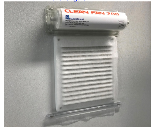
CLEAN FAN installed on cabinet fan