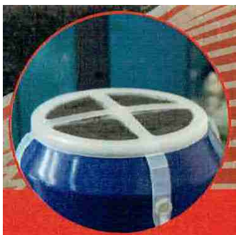
CLEAN FAN MOTOR fan filtration system