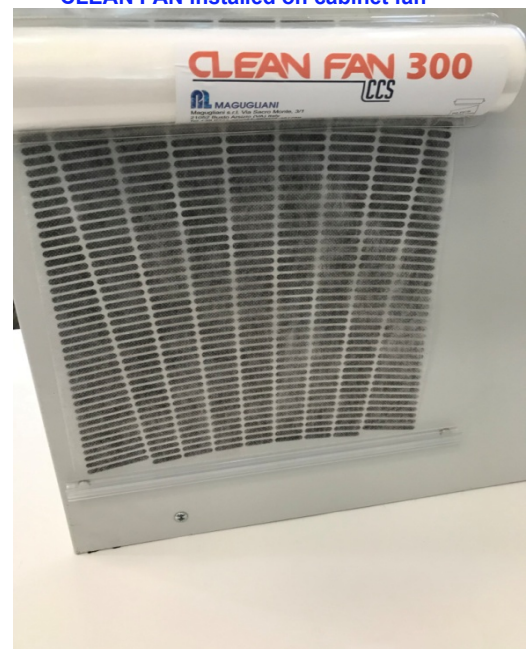
CLEAN FAN CCS air filtration system installed on an air conditioner